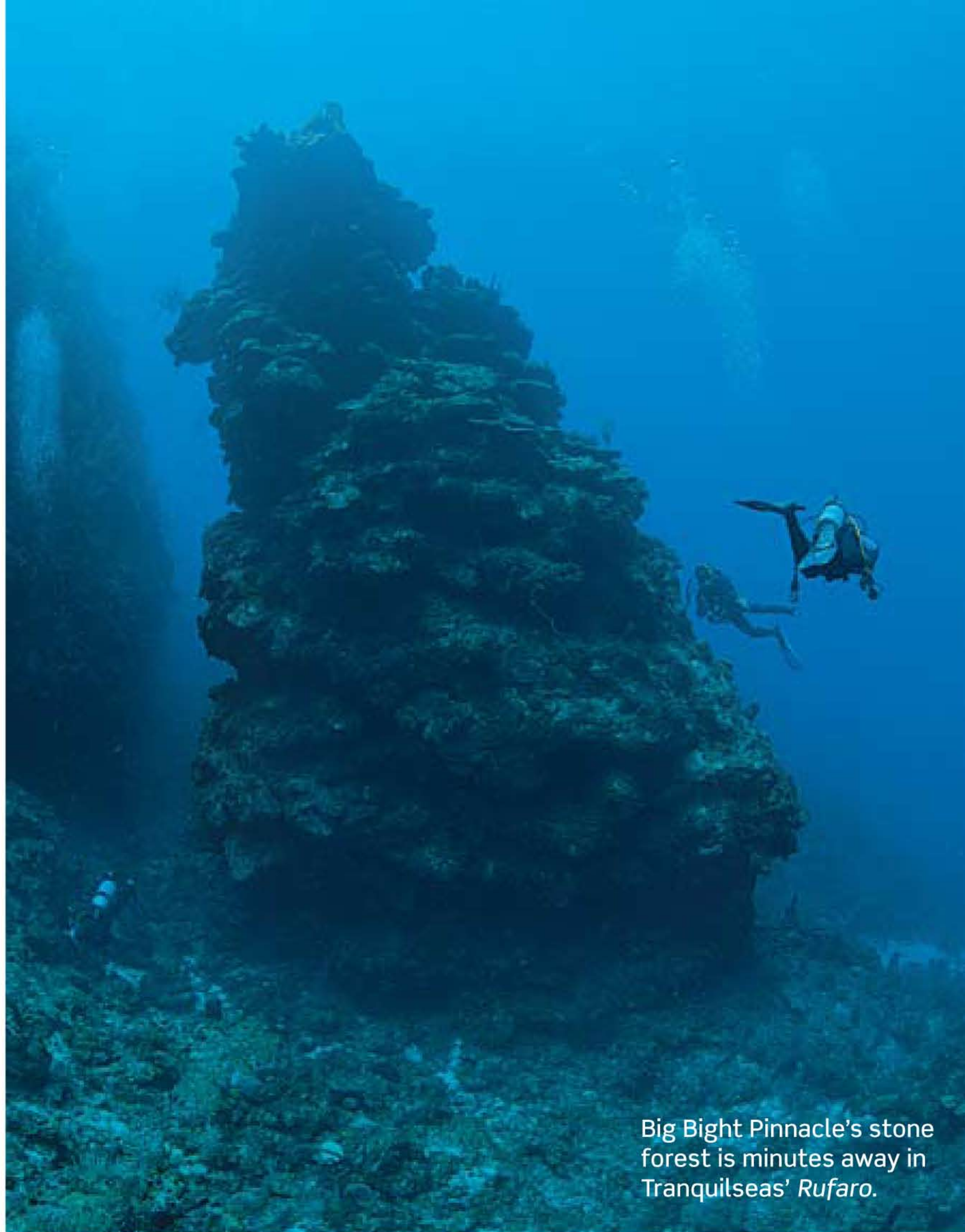
Big Bight Pinnacle's stone forest is minutes away in Tranquileas' Rufaro .